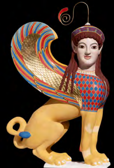
Marble capital and finial in the form of a sphinx (Greece, Attica, 530 B.C.)

Experimental color reconstruction of a marble finial in the form of a sphinx, Vinzenz Brinkmann and Ulrike Koch-Brinkmann, cast from polymethyl metacrylate, natural pigments in egg tempera, gold foil, and copper. Liebieghaus Skulpturensammlung, Polychromy Research Project, Frankfurt am Main