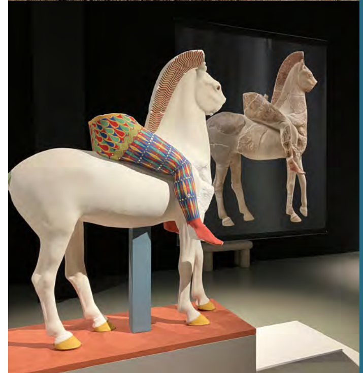
"Persian Rider," ca. 490 BC, Marble, Acropolis Museum, Athens

Experimental colour reconstruction of the so-called Persian Rider from the Athenian Acropolis, Vinzenz Brinkmann and Ulrike Koch-Brinkmann, marble stucco on PMMA, natural pigments in egg tempera, gold foil, 160 cm, Liebieghaus Skulpturensammlung, Frankfurt am Main